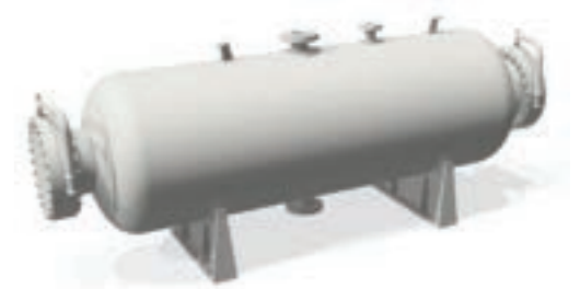
AS1210 Pressure Vessel