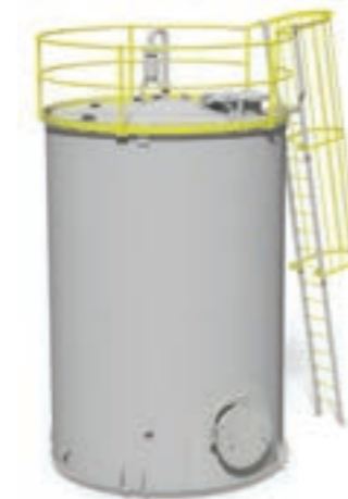
API650 Tank Design