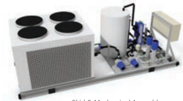
Skid & Mechanical Assembly