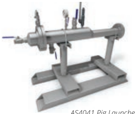
AS4041 Pig Launcher

Providing a range of specialised and complementary engineering and design services, Ingenia offers innovative solutions to meet and exceed our client's expectations.